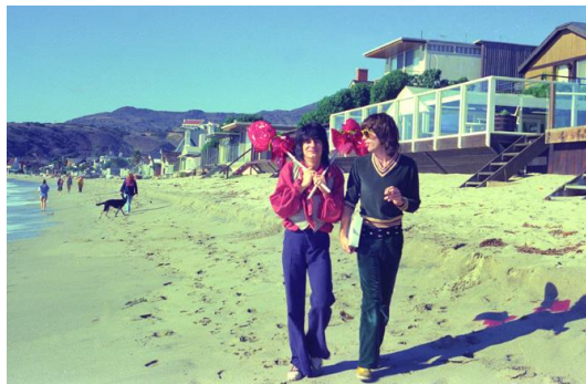
Ronnie Wood, Mick Jagger, Malibu Colony, '76 Beach, '83