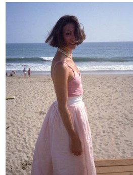
Anjelica Huston, Malibu